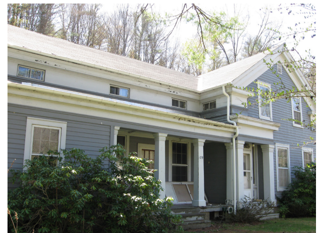
The Miller's House, 2010