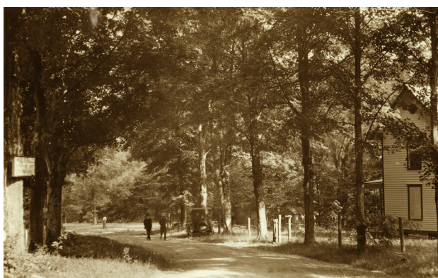
The Tryon House, circa 1924