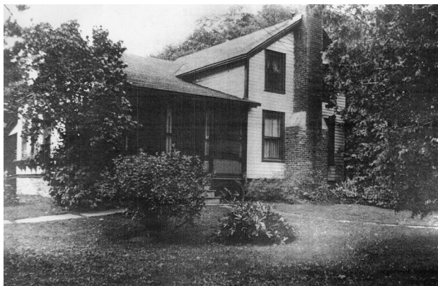
The Budd House, circa 1920