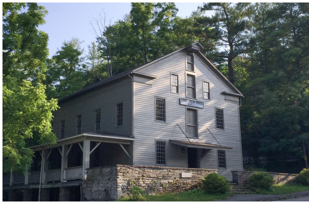
The Old Mill, 2018

Begin our walking tour at the Old Mill, a Greek Revival commercial building. The second and third floors of the Old Mill contain some of the machinery that was used when it was a functioning gristmill between 1839 and 1916. Also, in the basement there are displays that illustrate the big mill wheel and how the water was channeled to power the gristmill.