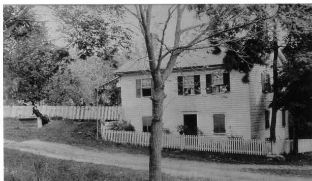
The Wickham House, circa 1880