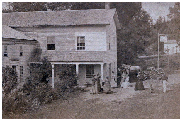
The Hotel in 1866