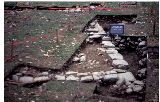
The Duncan-Bower House Excavation, Fall 2001

Less than a foot below the sod the archaeologists found the foundation of the Duncan family home.