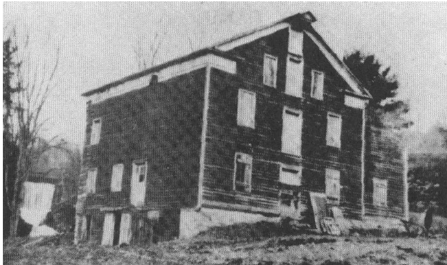
Above: The Old Mill c. 1920, before Park renovations