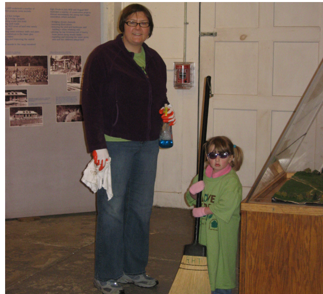
Mother & Daughter team cleaning Old Mill I love My Park Day 2014