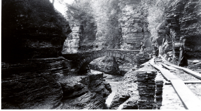
Above: The CCC constructing today's trails

The Friends of Robert H. Treman State Park look forward to celebrating the Park's 100th anniversary in 2020.