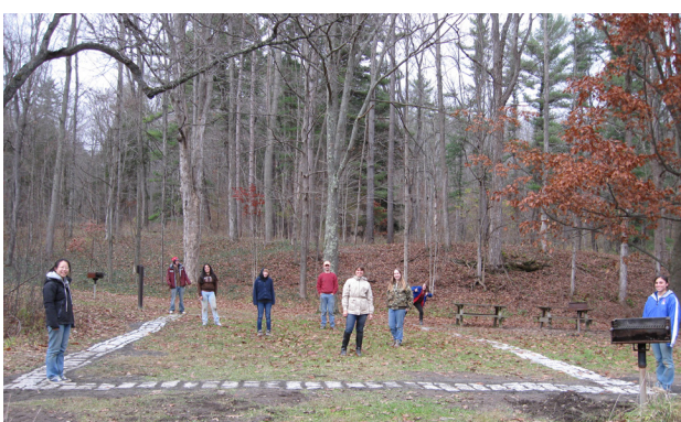
Volunteers smile after weeding the granite footprint of the Enfield Falls Hotel