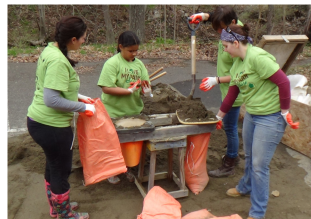
Volunteers helping to fill sandbags that the park staff used to repair stone masonry along the trail damaged by the 2013 flood.