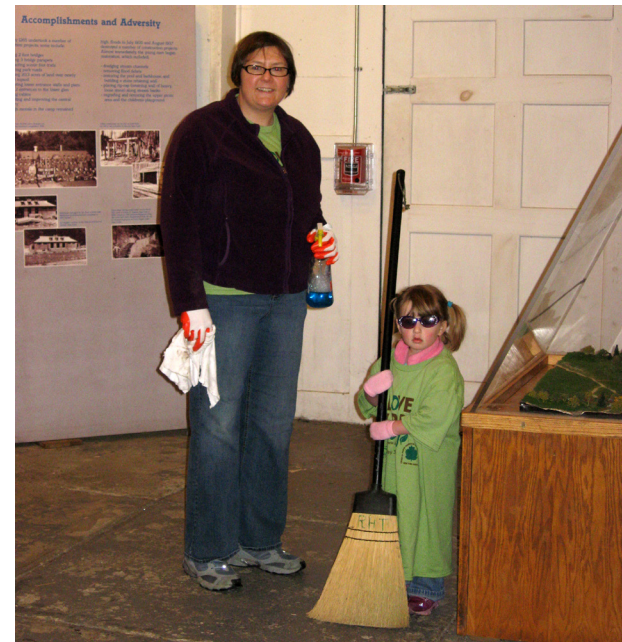
Volunteers of all ages come to help get the park ready for the summer tourists!

Friends of Robert H. Treman State Park 105 Enfield Falls Road Ithaca, N.Y. 14850