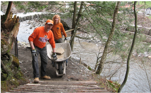
Volunteers bring fieldstones to repair trail masonry

Help us prepare the park for the summer tourist season by building picnic benches, clearing the paths of leaves, and repairing trails. Let's make the park sparkle like the local gem it is!