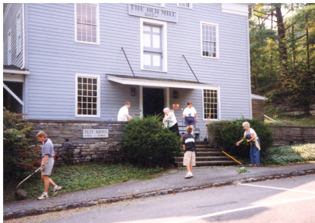
Spring grooming of the landscape outside the mill

Help us welcome visitors to our museum by cleaning the Mill, the exhibits, and the landscape in front of the mill!