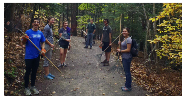
FORCES volunteers raking leaves on the Rim Trail

Contact Josh Teeter ( Josh.Teeter@parks.ny.gov ) or through a contact listed on tremanparkfriends.org for more information about the specific projects available through the FORCES program. Include a description of your interests and availability.