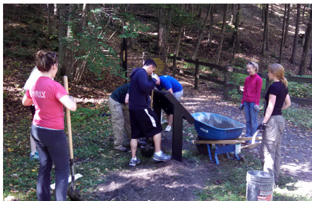
FORCES volunteers installing an interpretive sign

FORCES is a program aimed at boosting and growing student volunteerism within New York State Parks by providing the opportunity to participate in stewardship, conservation, and historic preservation projects. Student involvement can range from a one-day event, internships or long-term projects. Connecting students with the parks creates mutually beneficial partnerships that helps maintain and enhance the quality of visitors' experience while simultaneously strengthening the academics of students by providing them with hands-on experience.