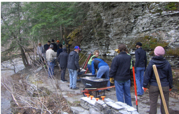
Volunteers help to repair the trails