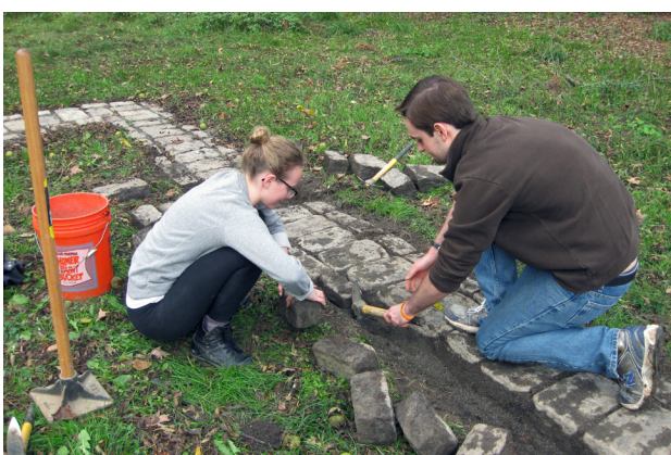
Volunteers resetting the pavers at the Budd House archaeology site after weeding

Have you been on our self-guided walking tour of the archaeology sites at Treman? Would you like to help keep this tour accessible to future visitors? Then sign up to help us by weeding and cleaning the granite footprints in the spring and summer.