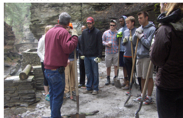
Volunteers preparing to break the ice on the Gorge Trail